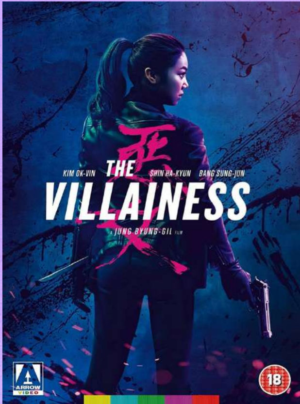
THE VILLAINESS (2017) South Korean BUDGET £2.3M BOX OFFICE £6.7M 2.9x ROI