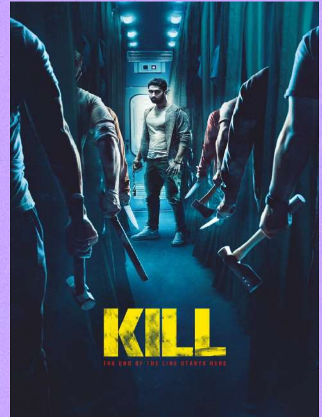
KILL (2024) Indian BUDGET £1.9M BOX OFFICE £4.5M 2.36x ROI

There a proven global market for martial arts action films with female leads. KALARI KAUR is UNIQUE as it is the first film ever to showcase KALARI. With its Indian, UK, Chinese and Canadian cast, it will appeal to the massive Chinese and Indian box office, the Indian diaspora, and all global fans of martial Arts/Action/Drama films. e.g. Furie’s primary market was Vietnamese, with a pop. of 97M. With a 1.4B pop, India’s market alone is x 14.