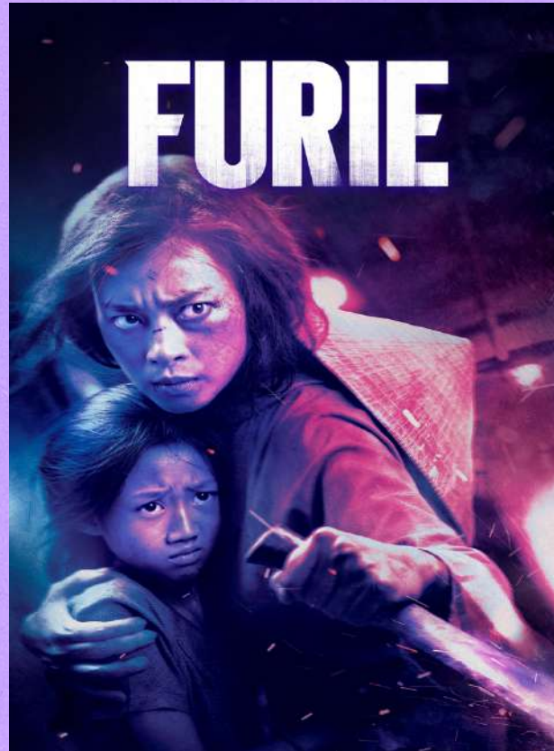
FURIE (2019) Vietnamese BUDGET £1.5M BOX OFFICE £6.6M 4.3x ROI